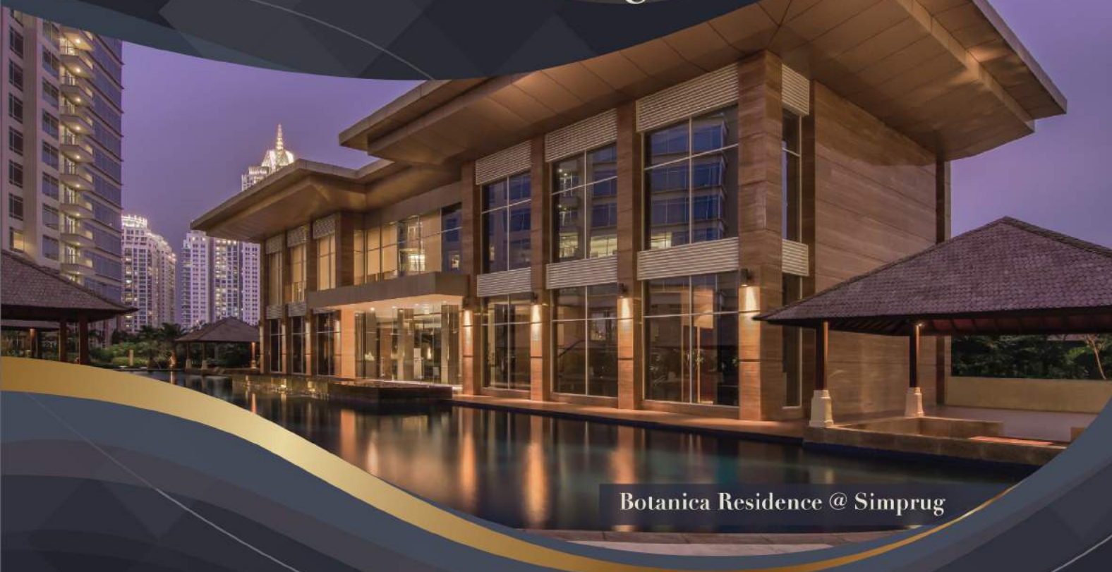
Botanica Residence @ Simprug